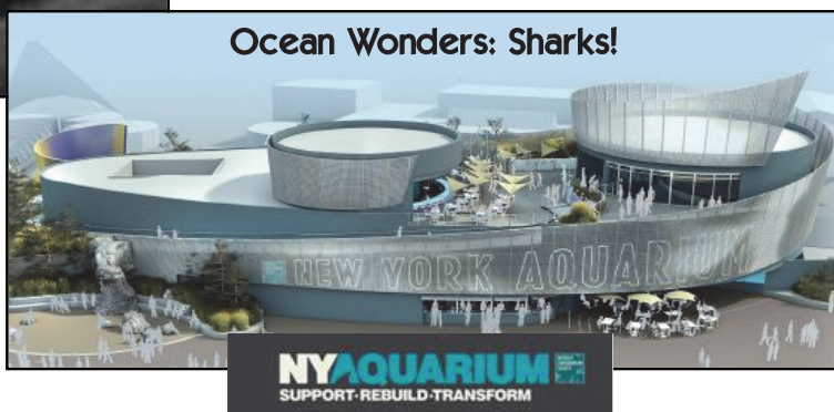
Artists rendering of the new Ocean Wonders: Sharks! exhibit

A memorial service was held at Pilgrim Congregational Church, 26 West Street, Leominster, MA on Friday, January 10.